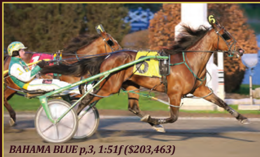
BAHAMA BLUE p,3, 1:51f ($203,463)

First foal from a NYSS division winner with nearly $500,000 on her card. Third dam has eight winners from 11 foals including Hes A Nice Guy p,3, 1:52.4s; 1:51.1s; BT 1:49.3s ($264,534).