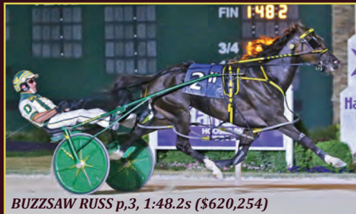
BUZZSAW RUSS p,3, 1:48.2s ($620,254)

October 18 & 19 - Indiana State Fairgrounds