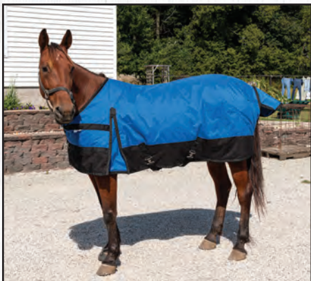
Blankets and Coolers